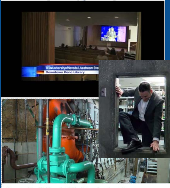
Knowing Nevada: Secrets hidden below downtown Reno During the mid-1960s, bomb shelters were common additions to homes and buildings under construction.Several still exist throughout Reno, including... mynews4.com